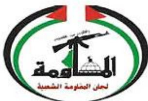
Popular Resistance Committees