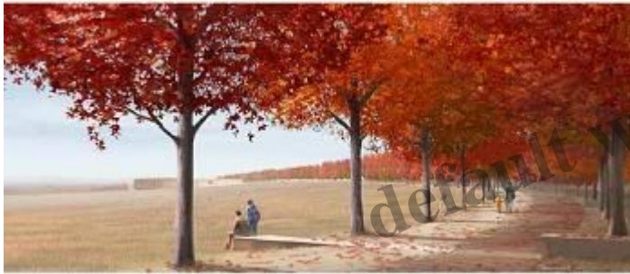
40 MEMORIAL GROVES Why then does the actual design only contain 38?

Stop the Memorial Blogburst: Why only 38 Memorial Groves? One prominently advertised feature of the Flight 93's crash site in Pennsylvania is the 40 Memorial Groves: