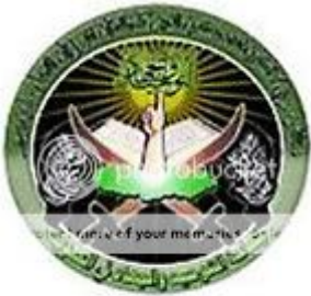
Jihad in Sweden