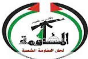
Popular Resistance Committees