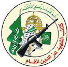
Ezzedein al-Qassam Brigades