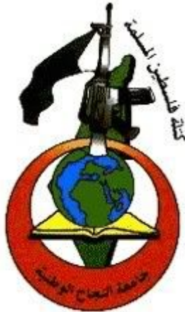
Jihad in Sweden