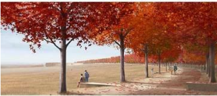
40 MEMORIAL GROVES